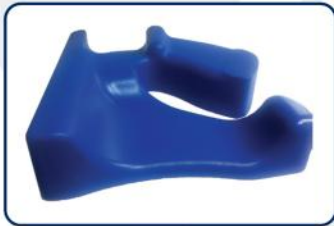
EPS-30 LP with Flat Headrest