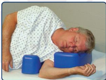
Maintains Elevation and Alignment