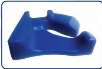
EPS-30 LP with Beveled Headrest