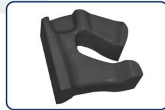
EPS-30 MP with Standard Headrest